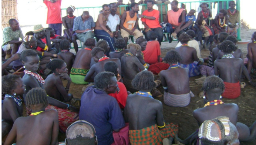
Fig. 1- Community members have strongly aspired for the developments like irrigation activities in their own village (Feb, 2010)

Particularly, when the Environmental and Social Monitoring & Management Team of Gibe III HEP carried out the public consultations, disclosure and extensive discussions with the downstream communities, they said that they are much satisfied with the mitigation measures and the proposed plans of the project.